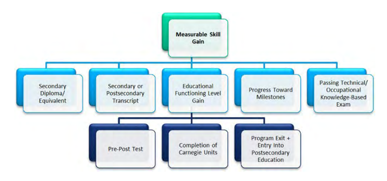
Figure 1. Five Types of Measurable Skill Gains under WIOA

IET program, the following section focuses on clarifying key terms and requirements for these types of MSG to help determine whether the specific gain meets the validation requirements for National Reporting System for Adult Education (NRS) reporting. Further explanation of the Kentucky IET/WPL Planning Tool Process can be found in the <u>State Guidance Section</u>.