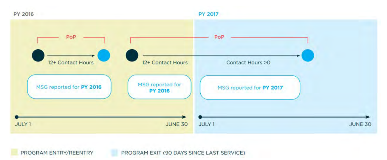
Exhibit 1-Periods of Participation (POPS): MSG Indicator

All participants have at least one period of participation, starting with their first enrollment in the program year and ending with their program exit. Subsequent periods are counted by reentry and exit. The exit date is the last day of service for participants, but this date cannot be determined until 90 days have elapsed since the person last received services and no future services are planned. However, <u>if there is no exit across a program year</u>, the PoP continues into the next program year and MSG is reported for the new program year.